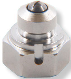
MIX NOZZLE TYPE OPTIMA